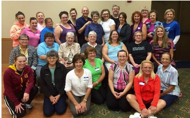
2015 Fall AMTA Conference Participants in Aberdeen