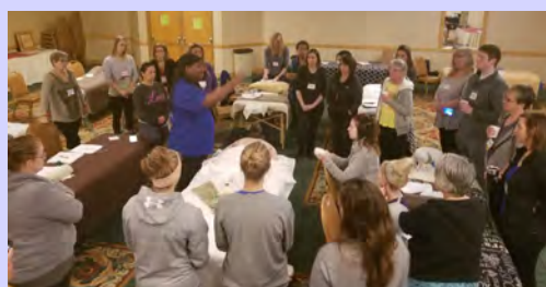
2018 Spring Conference ACE Cupping Level I Class