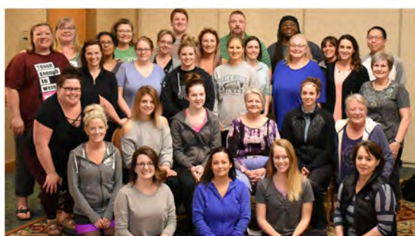
Ace Cupping Level II Class attendees.