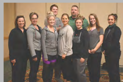
First time attendees at the 2018 Spring Conference.

Alone we are smart. Together we are brilliant.