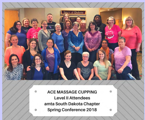
• ACE MASSAGE CUPPING Level II Attendees amta South Dakota Chapter Spring Conference 2018 •